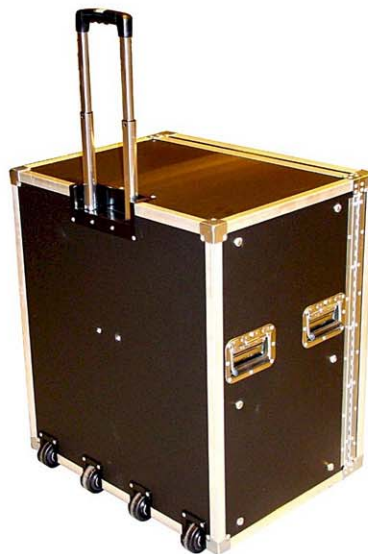
REAR VIEW CASE CLOSED (tow handle deployed)