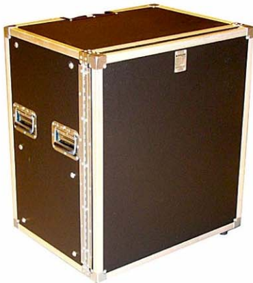
FRONT VIEW CASE CLOSED

with heavy-duty glide-mounted full extension drawers, case cart option with aluminum retractable tow handle and 4 heavy-duty recessed casters.